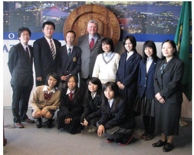
The Kobe delegation of students and teachers met Seattle Mayor Greg Nickels

To learn more about Seafair, visit www.seafair.com