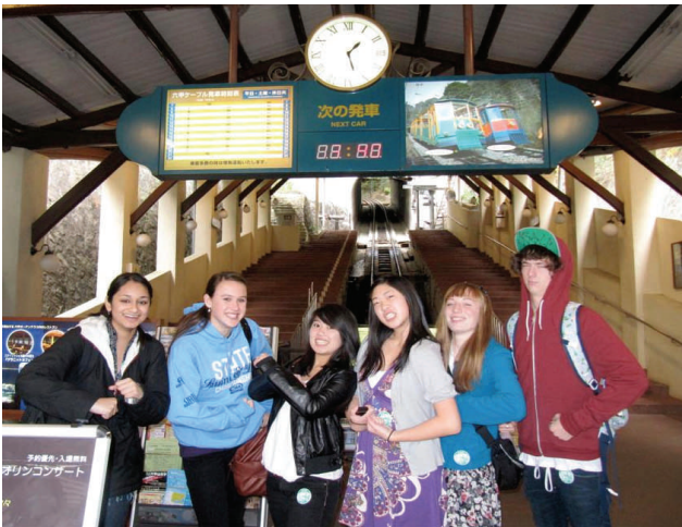
Seafair Ambassadors enjoyed touring Kobe, including Mt. Rokko.