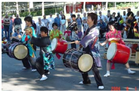
Hataikko Daiko attracts a crowd at Seattle Center.

which had a great earthquake, group members become engaged in the world they live in and are encouraged to think about issues of international peace.